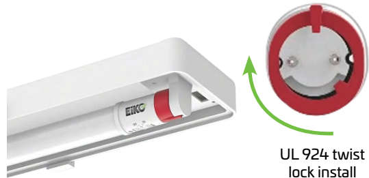
UL 924 twist lock install